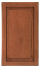
Maple Auburn Glaze

Distinct look. Darkest Finish. Gives finely grained Maple a furniture-like quality. A high-end rustic look on Oak.