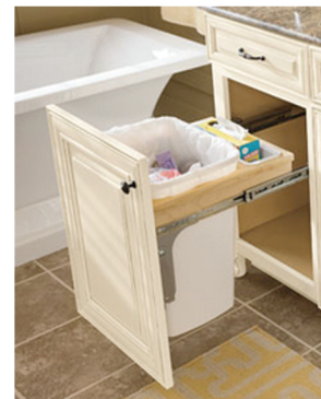
Vanity Wastebasket Unit