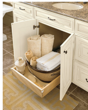
Roll Out Trays