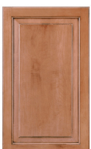
Maple Mocha Glaze

Copper tones. Stylishly flexible. Enhances Maple's fine grain with an elegant finish.