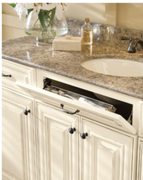
Stainless Tilt-Out Tray