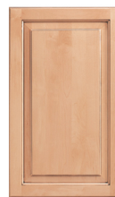
Maple Coffee Glaze

Light warm. Exceptionally versatile. Popular Maple and Cherry finishes complement any style. Enhances Hickory's dramatic color variations.