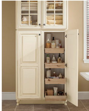
Linen Cabinet with Deep Roll Out Trays