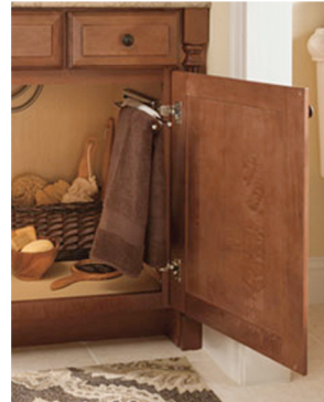
Sliding Towel Bar