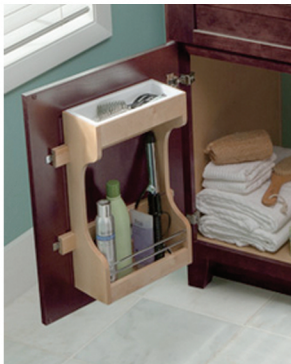
Sink Base Door Storage Unit